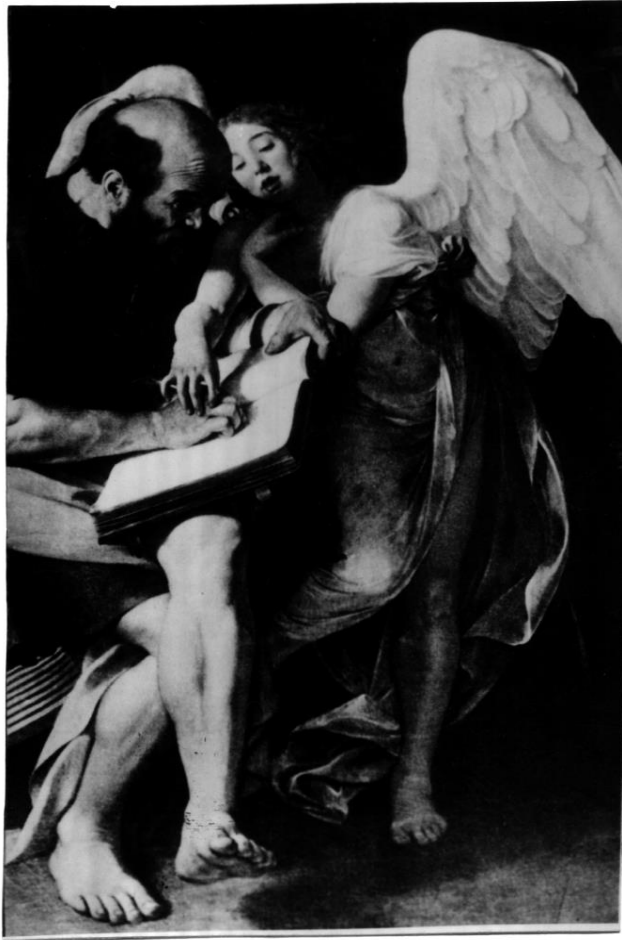
Picture: The painter Michelangelo da Caravaggio (1573 - 1610) depicted automatic writing in his picture " THE HOLY MATTHIAS WITH THE ANGEL",

The term politician applies to someone who is actively involved in politics. This certainly was not the case with CHRIST.