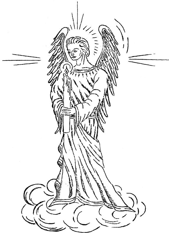
Picture: A BEARER of LIGHT

Four candles and two electric blue lamps burn during the meeting. Blue light possesses a lot of energy and it promotes contact with the other WORLD. This was suggested to us by the OTHER SIDE. The spiritual service begins with carefully selected music.